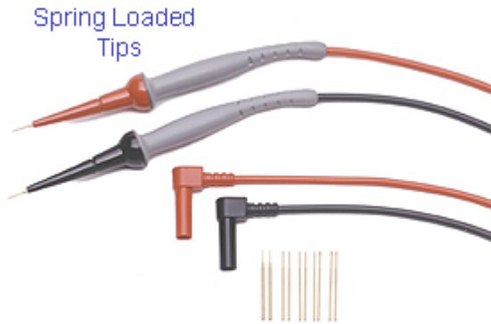
8150 Kit Shown

Recommended by Canon™ for Copier Servicing